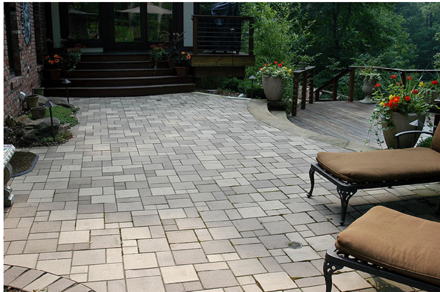
Beveled Edge w/ Spacing Lugs - Shades 50 Ivory, 52 Majestic & 53 Cimmerian Project courtesy of Vittum-Andrews Landscape Architecture