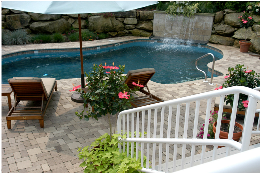
Old World Cobbled - Shades 50 Ivory, 52 Majestic & 53 Cimmerian Project courtesy of Vittum-Andrews Landscape Architecture